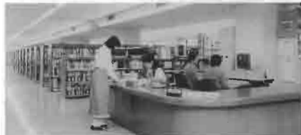
The Information Centre for Women's Education opened in 1987 as the nucleus of NWECC's information activities.

Research of issues touching on women's and family education.