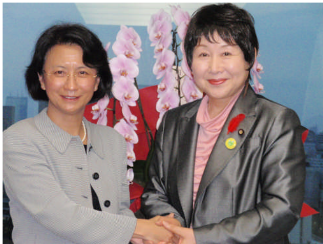
Minister Phavi (left) shakes hands with Minister Okazaki (right)

In the morning the following day on Saturday, October 9, gender equality administrative officials, researchers, and practitioners involved in international cooperation in various capacities joined Minister Phavi in a round table discussion. During the discussion the minister shared her views on gender equality administration and government