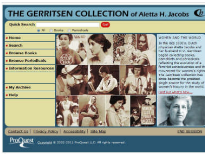
The Gerritsen Collection