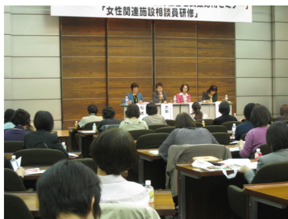
At a plenary session

The participants of this course also attended the Seminar on Support for the Victims of Spousal Violence (Applied Seminar) held during the same period. The program gave participants the opportunity to deepen their knowledge of spousal violence, an issue that must be resolved to realize a gender-equal society. Some of the comments made by participants were: “All the lecturers were wonderful people. I am really happy that I was able to attend this seminar,” “This seminar was truly meaningful and gave counselors a sense of empowerment,” “This seminar enabled me to reaffirm the meaning and responsibility of my own work.”