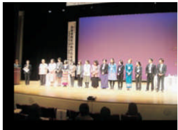
At the National Shelter Symposium in Kurume

The main purpose of this workshop is to deepen a mutual understanding between Japan and Thailand among the stakeholders involved in policies to protect victims of human trafficking in Thailand and to investigate measures that will contribute to strengthening the cooperative roles and activities of multi-disciplinary teams (MDTs) in Thailand. Based on the 2009 Action Plan to Combat Trafficking in Persons, the first half of the 2-weeks workshop consisted of lectures concerning various initiatives of the Cabinet Secretariat, the Gender Equality Bureau of the Cabinet Office, the Ministry of Foreign Affairs, the National Police