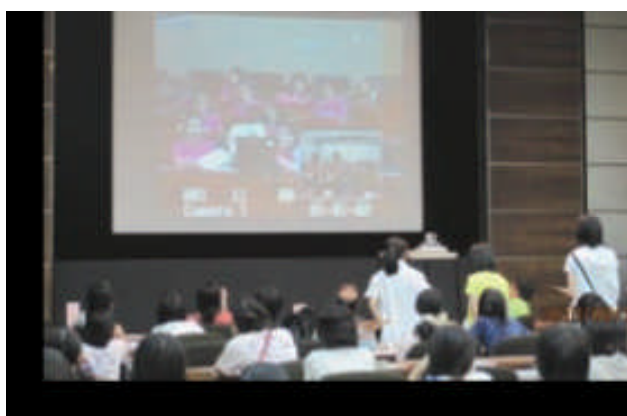
Teleconference with a Korean girls' high school Physics camp

The Science Café, an innovative program for parents and teachers, provided up-to-the minute information and information on general trends in government and the corporate world to parents. Parents and teachers alike found this form of discussion very helpful and a number of them commented that the two-hour session was over before they knew it. In the program for teachers, the participating teachers prepared a simple teaching guide to enable other teachers to incorporate outcomes of this program into the curriculum. Teaching assistants (TAs) from universities and graduate schools also planned fun-filled activities such as the “Science Battle” and “Science Sugoroku ” that enabled students to experience the joy of science as they engaged in friendly exchanges with the TAs.