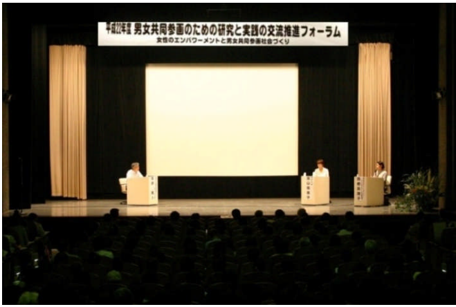
At the Symposium