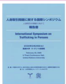
Report of International Symposium on Trafficking in Persons