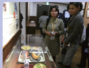
Visit to Museum of the Ministry of Education (Japanese school lunch exhibition)

Empowerment Seminar for Women Leaders in the Asia Pacific Region