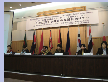
Policy Recommendation on VAW Eradication

2009 International Forum for Women's Empowerment @JICA