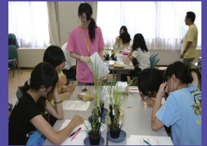
2009 Summer Science School for Girl Students