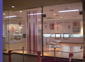
The Women's Archives Center (Opened in June 2008)