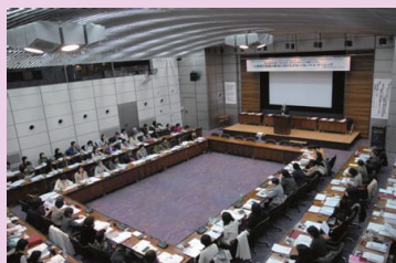
2008 International Forum for Women's Empowerment