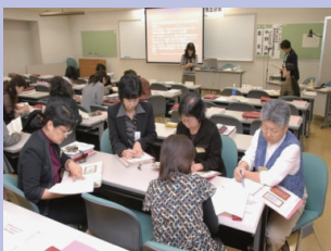
Domestic training program at NWEC