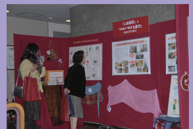
Panel Exhibition at NWEC